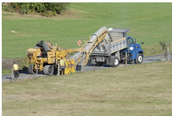
Penn Township Road Crew did a great job widening Smith Road making it wider and safer.