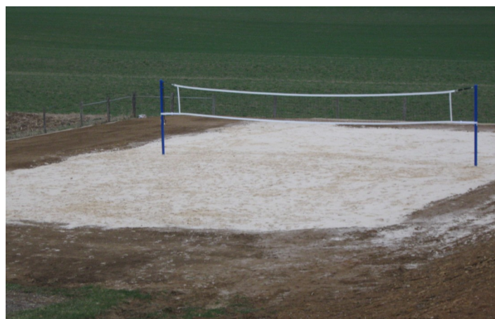
The new volleyball court is up and ready for use. Available on a first-come, first-serve basis. Please bring your own ball.