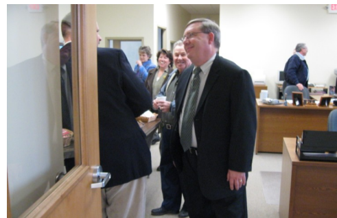
Penn Township residents enjoy the open house