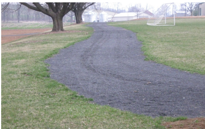
Residents can enjoy the newly completed walking trail

If you have any questions, please give us a call at 486-3104.