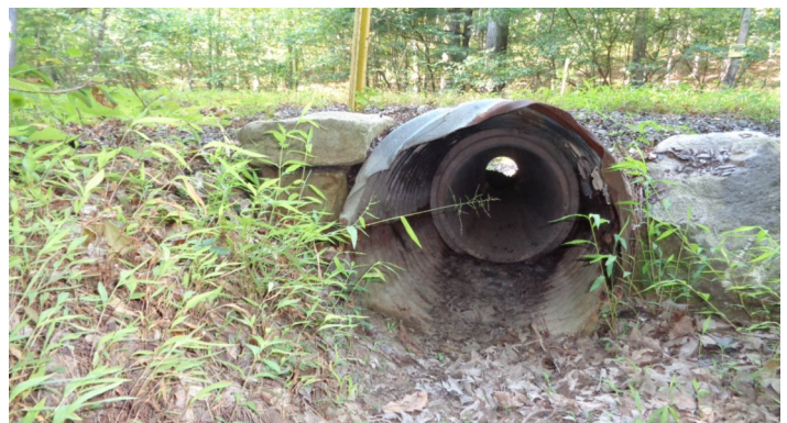
Culvert pipe at the beginning of the project